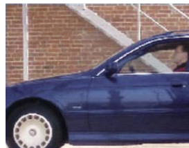
Progressive Scan, all lines are captured at the same time

Progressive scan is used instead of the interlaced method found in analog CCTV (PAL/NTSC) cameras. With progressive scan all pixels (lines) are captured at the same time, enabling moving images to be presented without distortion.