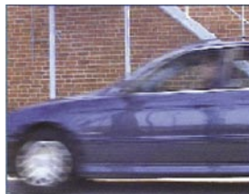
Interlaced, 20 ms difference between odd and even lines